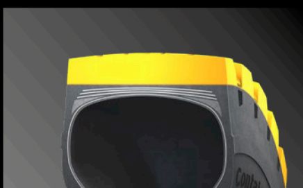
High mileage and lifetime